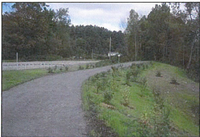
Repaired trail and Route 19A