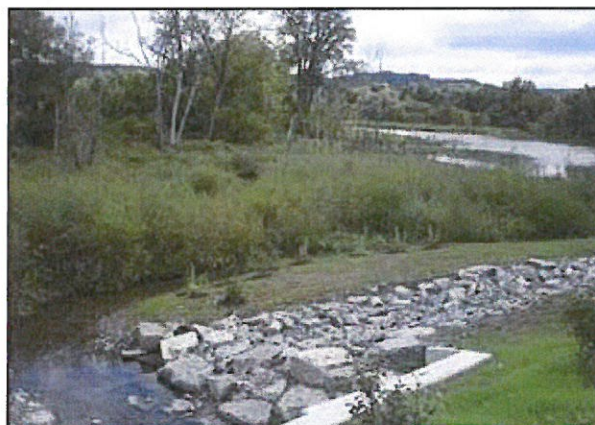
New culvert and Oxbow Lake in background.